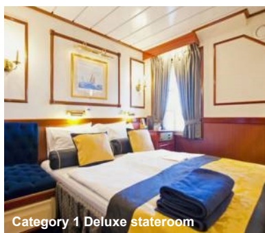
Category 1 Deluxe stateroom